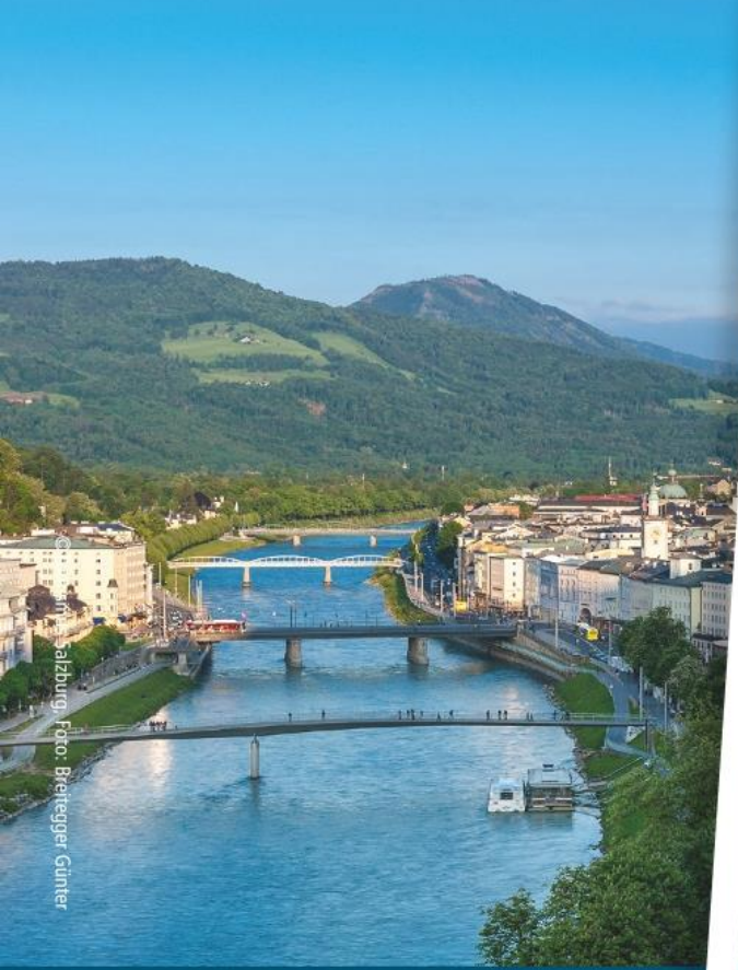
Salzburg, Foto: Breitegger Günter